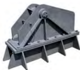
Chain Cable Stopper (OCIMF Type) (for Dia. 76mm chain)

SWL: 2000 Kn MBL: 4000 Kn Option: with plinth